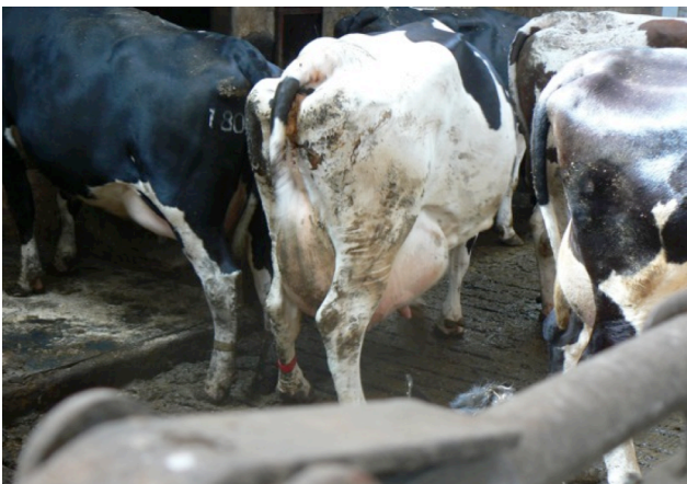
Barren, overcrowded, often filthy conditions

EFSA is the body that at the EU level is responsible for providing scientific opinions on the health and welfare of animals. EFSA was established by Regulation (EC) NO 178/2002 of the European Parliament and of the Council laying down the general principles and requirements of food law, establishing the European Food Safety Authority and laying down procedures in matters of food safety. Article 22 of Regulation 178/2002 states that the mission of EFSA includes the provision of scientific opinions relating to animal health and welfare.